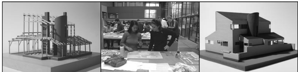
Figure 1 3D physical modelling on the basis of 2D CAD files.