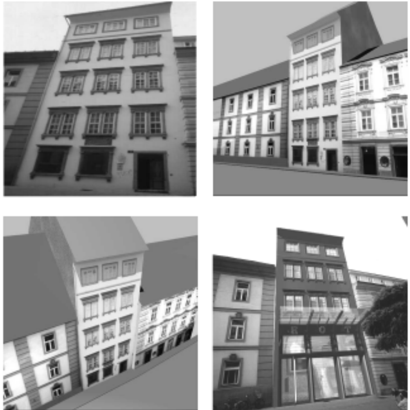
Figure 2. The “rough” model and an example of the application in the framework of a project (a) sectional inventory photograph/ (b.-c) 3D-model with facade mapping / (d) computer-assisted simulation of renovation.

Radford, A., Woodbury, R., Braithwaite, G., Kirkby, S., Sweeting, R. and Huang, E. Issues of Abstraction, Accuracy and Realism in Large Scale Computer Urban Models. In: CAAD Futures 1997 [Conference Proceedings], München (Germany) 2001. CAAD Futures 1997 and Virtuality