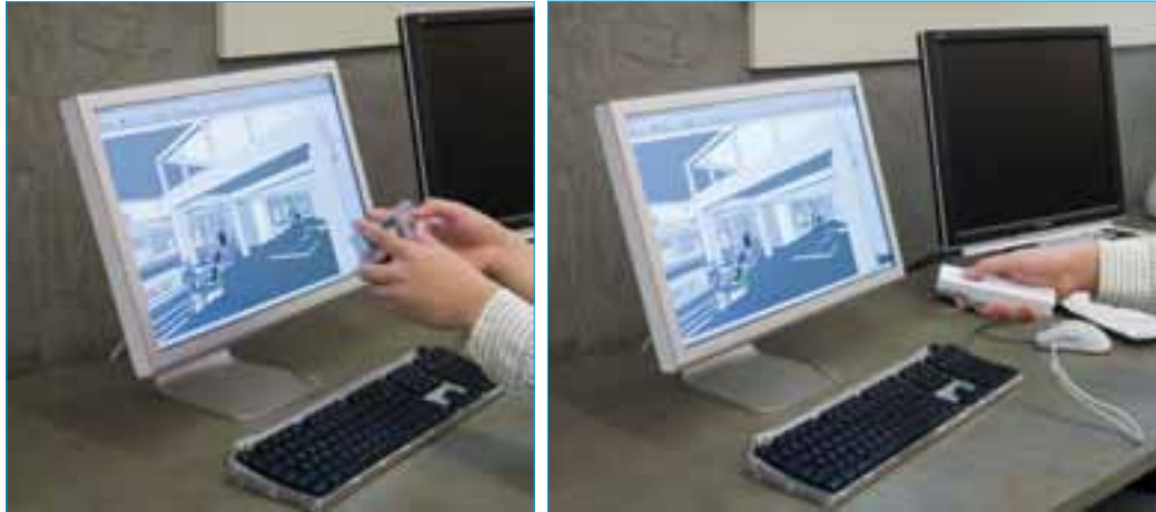
Figure 1 & 2 Gizmo (left) and WiiView (right)

Our devices are very similar to (though much less expensive than) the “Bat” (Ware and Jessome 1988). Architectural design has occasionally been a subject of tangible interface research: the Cubic Mouse (Fröhlich et al. 2000) and the “two-4-six” (Kulik, Fröhlich, and Blach 2006) are related most directly to our work.