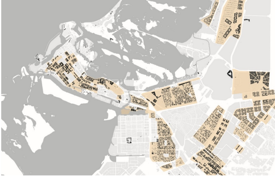
Figure 1. Low-rise neighborhoods in Abu Dhabi city.