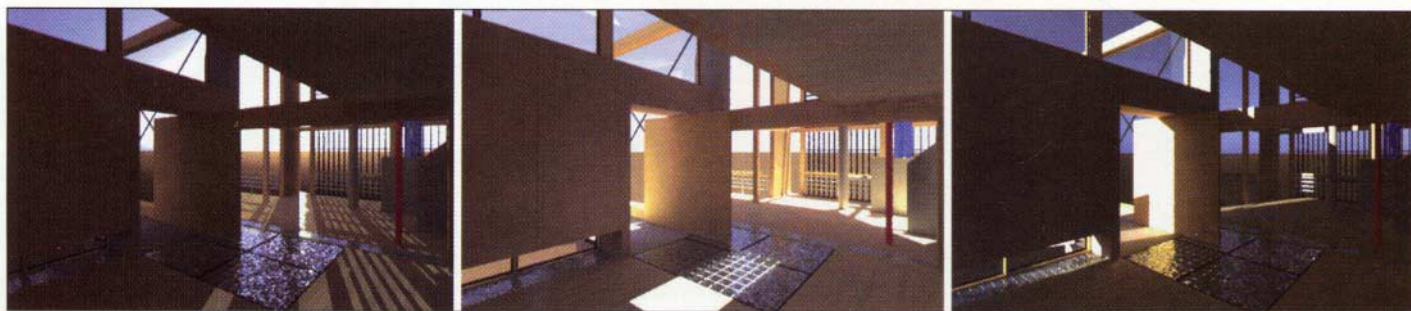
Figure 2: Tenerife House renderings at different times of day. Designed by Ann Pendleton-Jullian; modeled and rendered by Jack deValpine and Ben Black, VISARC Inc., Boston, MA. See page 99 for image in full color.

In the generative and developmental stages of the design process, the representations are distinctly speculative in nature. Thoughts come to mind as designers view a drawing or model in progress, which can alter their perceptions and suggest new possibilities. The emerging representation allows them to explore avenues that could not be foreseen, and ideas are generated along the way. Once executed, each representation depicts a separate reality that can be seen, evaluated and