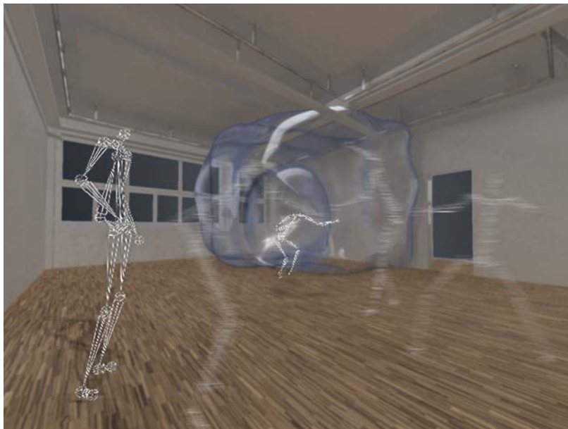
Figure 1. Shows a Visualization of full body interaction between users, a virtual volume and the physical area (the media laboratory where spacensing is installed).

To get an imagination of the cybernetic sociofacts, we conceived the constitution of virtual spaces through four necessary steps, which are constructed on one to other. These steps are: tracking, analyzing, simulating and interacting. They are described in the following section. The fundamental idea consists of: Synchronizing the movement in physical areas with the movement in their virtual counterparts, extending this virtual area with individual components and finally designing these add-ons with customized “brushes”. These “brushes” are virtual tools, generated as a simulation from previous movement analysis. Both, full body data, which deforms a volume in a specific relation, and rigid body data, which draws lines, models objects or produces particles, are applied.