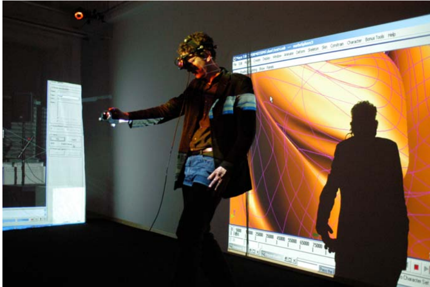
Figure 2. Physical interaction using spacensing to reshape a virtual designed furniture.