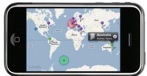
Fig. 1: General Interface with Map, POIs, and Annotations.

The examples shown here are just a general global example with continental landmarks and one of our testing area