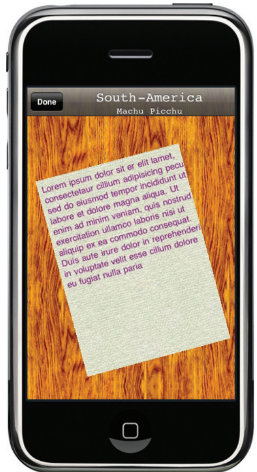
Fig. 3: Note written on a phone

The only real exception worthwhile mentioning is geocaching. This is a form of gaming, where participants have to visit a certain location defined in coordinates, find a hidden box with a notebook and sign it. The physical presentation of the box and the note-book remains a problem, because of possible