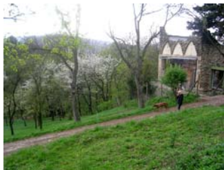
Fig. 1. Ruinenvilla in Dehnepark (Vienna)

Geographically speaking, the parkland area in Vienna's 14th District that bears the name of Dehnepark is part of the wide expanse of the Wienerwald (Vienna Woods). The park offers visitors a “dreamy” landscape for short or longer walks. On an area of about 5 hectares one finds a hilly landscape, generally gently sloping with some steeper inclines, wooded parts with clearings, a hamlet, orchards, and a ruin, the so-called Ruinenvilla (Fig. 1) which is no longer accessible today and is to be made the focus of the redesign exercise. The objective was to investigate possible future scenarios for the park and the remaining buildings which, albeit used by visitors, presents itself in a somewhat neglected and unkempt state and does not at all find the appreciation which the significance of this property would merit. The design proposals and visions developed should lead to a revival of or novel take on the area.