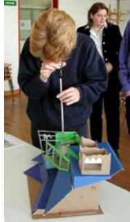
Fig. 2. Endoscopic viewing during mid-term review

can simply be explained by the fact that the resulting image seems more “attractive” than an undifferentiated and poorly “readable” rendered image of a slope. A physical scale-model is perceived very differently. Viewing through an endoscope or with the naked eye invites focusing on a ground perspective and will lead to an “attractive” and differentiated image. (Fig. 2, Fig. 3, Fig. 4(a,b)).