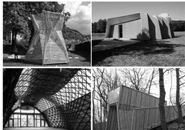
Figure 1. top-left) piling-up, BWIF Sculptures, Bergen, Norway. top-right) tessellation, Saint Loup chapel, Switzerland. Bottom-left) mesh, Weald & Downland museum, Chichester England. Bottom-right) framework Observation platform,

Just as the first step in this research began by categorizing 5 families of construction (piling-up, tessellation, mesh, membrane and structural frames) (Fig. 1) and assembly techniques (“slotting together”, “mortise and tenon”, etc.), construction knowledge refers to topological information and 3D positioning of components, while assembling logic defines the types of connection and joints between them. This will be the basis for