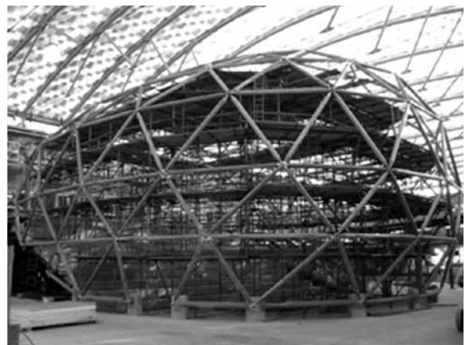
Figure 2. "Napier University", Edinburgh, Scotland

Here the grid is a regular oblique grid with three axes passing from each point. The organization of all three sets of axes is linear and the angular value is about 60^\circ . Intervals of both two axes are approximately constant. The section is an extruded standard section in the form of circle. Sections at the two ends are identical and there is neither a shift in the direction of x or in y. The next issue concerns the categorization of different assembly methods which is not, for the moment, integrated in the model.