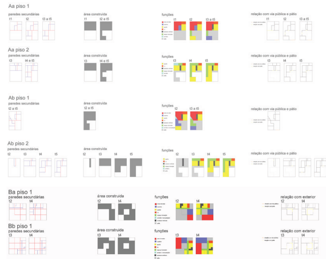
Figure 1: Case-studies analysis.

generative parametric computational methods and digital fabrication that allows a more qualified and easier to control custom mass production, with benefits both for authorities and inhabitants.